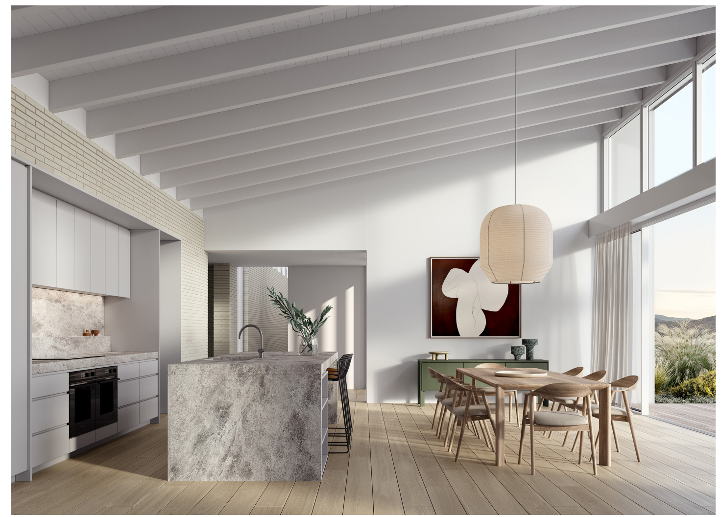
Featuring artwork courtesy of Clare Dubina.

This Vista House has been created for a large site within a rural/coastal setting. The configuration of the form lends itself to a broad site, with Northern orientation/views.